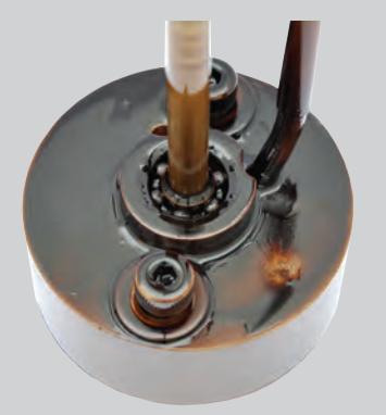
LEADING CONVENTIONAL HYDRAULIC FLUID (ISO 46)