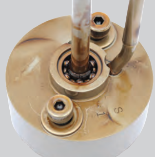
AMSOIL MULTI-VISCOSITY SYNTHETIC HYDRAULIC OIL (ISO 46)

Strong wear protection is equally critical to long hydraulic system life. After 608 hours of strenuous hydraulic pump testing, the piston shoes demonstrated only moderate polishing and trace, random scratches, proving AMSOIL Multi-Viscosity Synthetic Hydraulic Oil excels at protecting yellow metals. The vane pump cam ring exhibited only light polishing and trace scratching, further confirming the excellent wear protection provided by the oil.