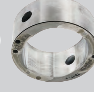
VANE PUMP CAM RING