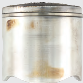
SABER Professional @ 100:1