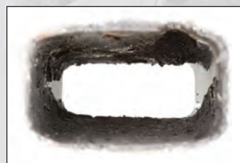
SABER Professional @ 100:1 4% Airflow Loss