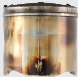
ECHO Power Blend @ 50:1