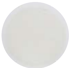
Ultra-low varnish potential