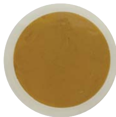
Critical varnish potential