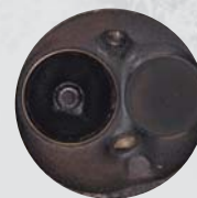
Cylinder head before P.i. treatment.