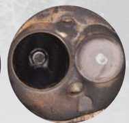
Cylinder head after one P.i. treatment.