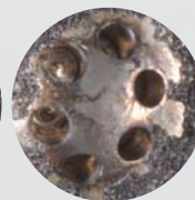
Injector after one P.i. treatment.