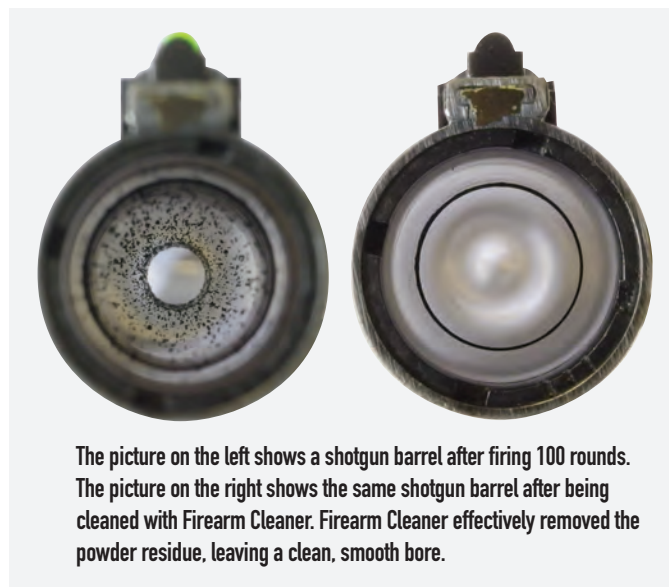
The picture on the left shows a shotgun barrel after firing 100 rounds. The picture on the right shows the same shotgun barrel after being cleaned with Firearm Cleaner. Firearm Cleaner effectively removed the powder residue, leaving a clean, smooth bore.

AMSOIL products are backed by a Limited Liability Warranty. For complete information visit AMSOIL.com/warranty.aspx .