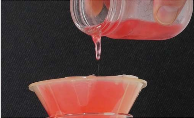
Wax formation in untreated diesel fuel resists pouring.

lowers the cold filter-plugging point (CFPP) by up to 40°F (22°C) in ULSD.