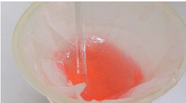
Wax formation in untreated diesel fuel plugs a coffee filter.