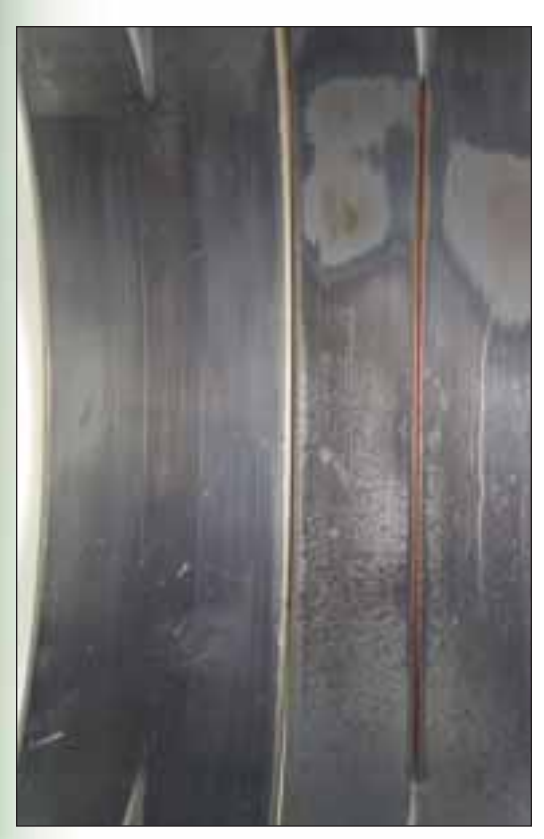
Engine main bearing halves show very little wear and are still suitable for continued use.

Each truck produces six quarts of waste-oil per oil change. With 60 vehicles being serviced every four months, that's 360 gallons per year. By switching to AMSOIL Guardian Pest Control prevents the disposal of 720 gallons of waste-oil every year. The environmental impact of this savings is enormous. It also frees up shop space that would be eaten up by drums of used oil.