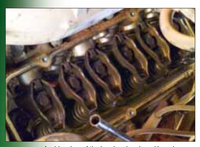
A wider view of the head and rockers. Very clean.