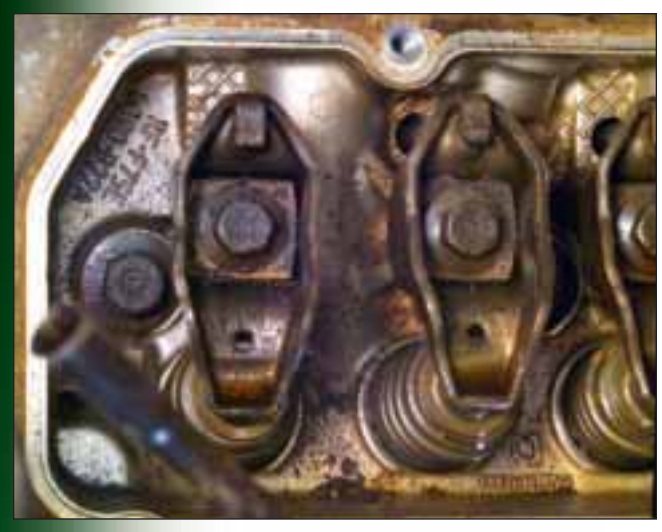
The head and rocker arms were very clean and free of heavy deposits. Note that you can still see the honeycomb stamping and manufacturer's part number. This is normally an area of the engine where you would see heavy varnish deposits with a conventional engine oil.