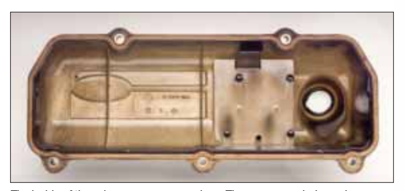
The inside of the valve cover was very clean. There were no sludge or heavy varnish deposits present. Note that you can still read the manufacturer's markings.

AMSOIL purchased one of Guardian's service trucks and disassembled the engine. The test truck is a Ford F150 two-wheel drive manual transmission unit with 225,000 miles. AMSOIL has been performing used oil analysis on Guardian's fleet since April 2005, and tested emissions and the catalytic converter on the truck the company purchased from Guardian. The accompanying photos detail the condition of the 225,000mile engine at the tear-down.