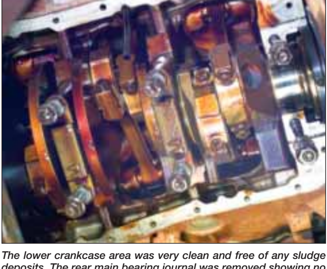
deposits. The rear main bearing journal was removed showing no signs of visible wear on the crankshaft journal.