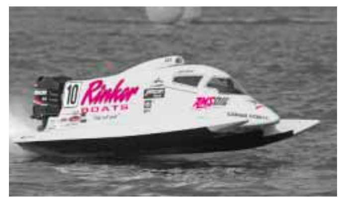
Return of the Champ – Rinker scores second championship.

the team was able to dry out and fix the boat in time for the start.