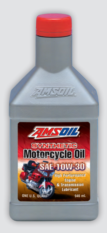
API SG • SL/CF • CG-4 JASO MA/MA2 • ISO-L-EMA2 SAE 80 • API GL-1

AMSOIL 10W-30 Synthetic Motorcycle Oil contains no friction modifiers and promotes smooth shifting and positive clutch engagement. It is engineered to control heat and prevent slippage and glazing, promoting longer clutch life.