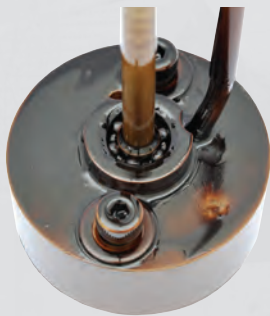
LEADING CONVENTIONAL HYDRAULIC FLUID (ISO 46)