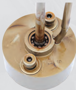
AMSOIL SYNTHETIC MULTI-VISCOSITY HYDRAULIC OIL (ISO 46)

Excessive oxidation results in harmful deposits and varnish that cause a host of problems, including stuck valves and decreased efficiency. In severe oxidation testing, AMSOIL Synthetic Multi-Viscosity Hydraulic Oil resisted elevated heat and oxidation more effectively than the conventional fluid.