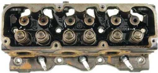
Cylinder head pre-cleanup. Note the sludge deposits on and around the valve springs and push rod openings.