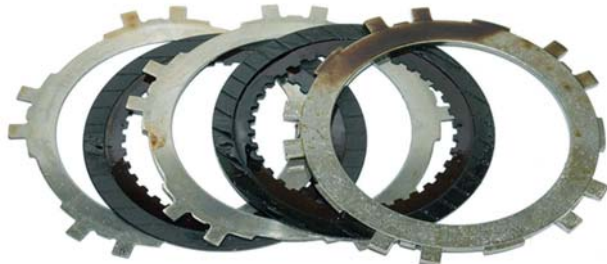
Automatic transmission clutch plates after cleanup with AMSOIL Engine and Transmission Flush reveal lighter glazing and varnish.