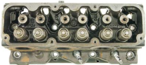
Cylinder head after cleanup with AMSOIL Engine and Transmission Flush. The valve springs and push rod openings are noticeably cleaner, with fewer sludge deposits. The manufacturer's stamping is more easily seen.