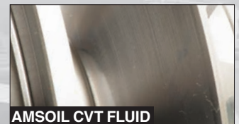
AMSOIL CVT FLUID