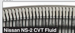
Nissan NS-2 CVT Fluid