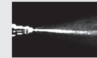
Injector pattern before P.i. treatment