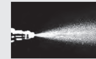
Injector pattern after P.i. treatment