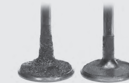
Intake Valve before P.i. Treatment